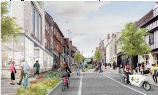
From the COTP document: Oxfordshire County Council

Please respond welcoming this as a big step in the right direction at